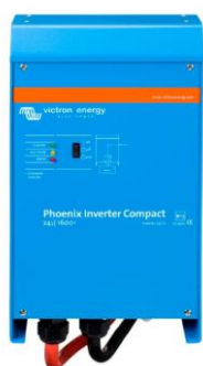
Inverter Compact 24/1600

The possibilities of paralleled high power inverters are truly amazing. For ideas, examples and battery capacity calculations please refer to our book 'Energy Unlimited' (available free of charge from Victron Energy and downloadable from www.victronenergy.com ).