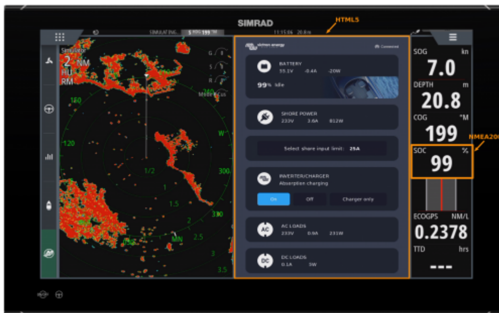
Picture showing the two integration options, NMEA2000 and HTML5 App. Click to see full size and see the difference between the two.

Make sure to closely read this full document to find the best method for your type of system.