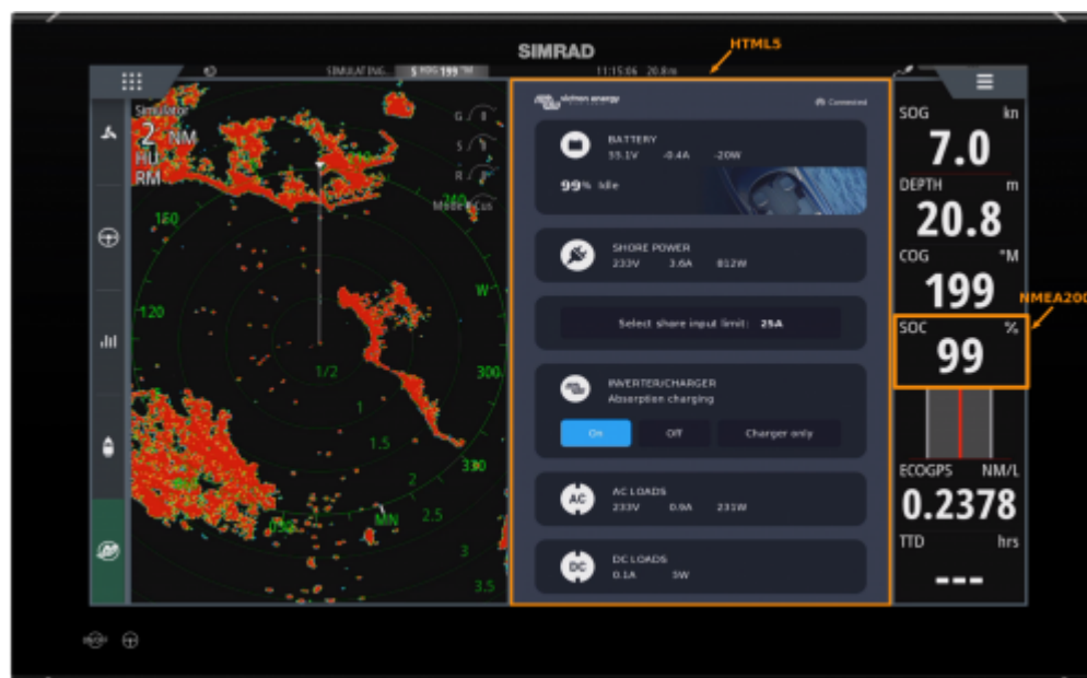
Picture showing the two integration options, NMEA2000 and HTML5 App. Click to see full size.

Make sure to closely read this full document to find the best method for your type of system.